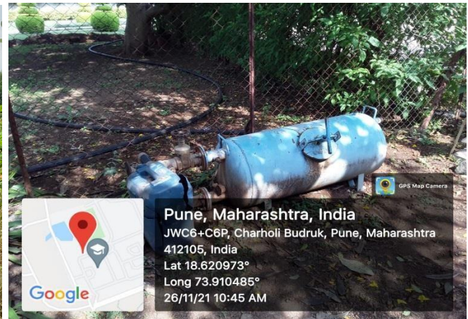
Water Supply system for gardening