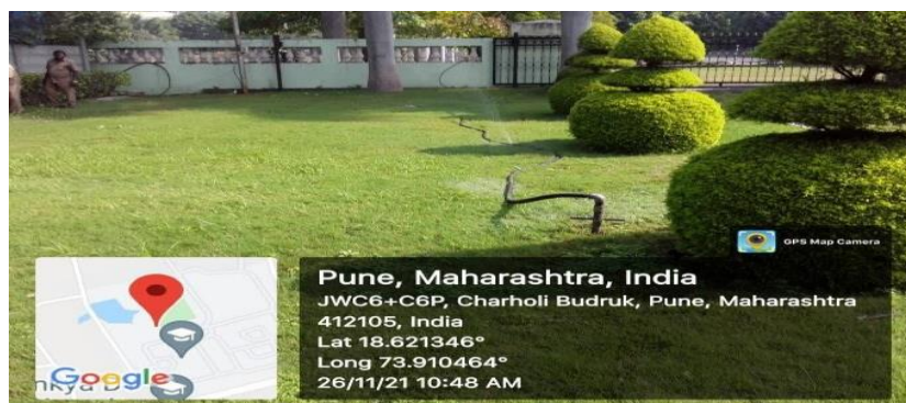
The treated water is supplied to gardens located