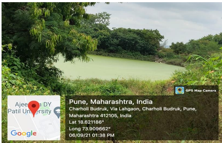
Lake where sewage treated water is disposed

The liquid waste in the campus is treated in the STP which is centrally located in the campus. After treatment this liquid is disposed in the two ways. One is in the lake and other is reused for gardening purpose.