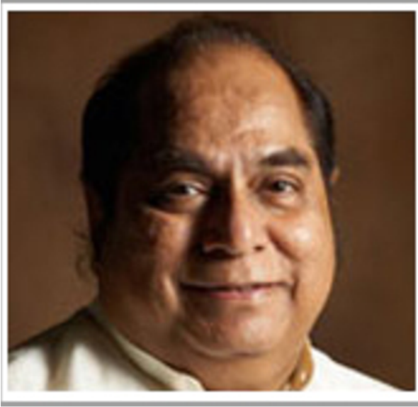
Dr. D Y Patil (Founder D Y Patil Group)

Dr D Y Patil, a Padmashree recipient, and former Governor of the Indian States of Bihar, Tripura and West Bengal is the founder of the D Y Patil Group. In the realm of Education and Healthcare in the state of Maharashtra, one name stands out like a shining beacon, that of Padmashree Dr D Y Patil. His vision, dedication and passion have been indelibly influenced, by his wisdom and generosity and have left several benchmarks, be it in the schools for imparting basic education or institutes for higher learning. He has materialized his dreams under the umbrella of prestigious education institutes in Kolhapur, Navi Mumbai and Pune. Padmashree Dr D Y Patil is the Governor of Bihar since 27th Nov 2009.