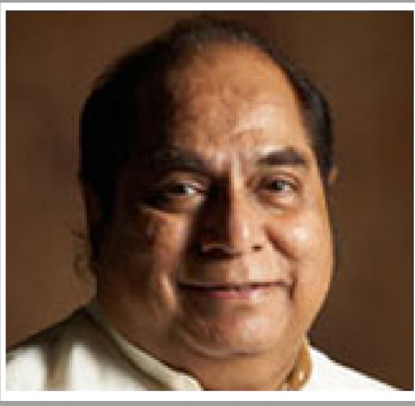
Dr. D Y Patil (Founder D Y Patil Group)

Dr D Y Patil, a Padmashree recipient, and former Governor of the Indian States of Bihar, Tripura and West Bengal is the founder of the D Y Patil Group. In the realm of Education and Healthcare in the state of Maharashtra, one name stands out like a shining beacon, that of Padmashree Dr D Y Patil. His vision, dedication and passion have been indelibly influenced, by his wisdom and generosity and have left several benchmarks, be it in the schools for imparting basic education or institutes for higher learning. He has materialized his dreams under the umbrella of prestigious education institutes in Kolhapur, Navi Mumbai and Pune. Padmashree Dr D Y Patil is the Governor of Bihar since 27th Nov 2009.